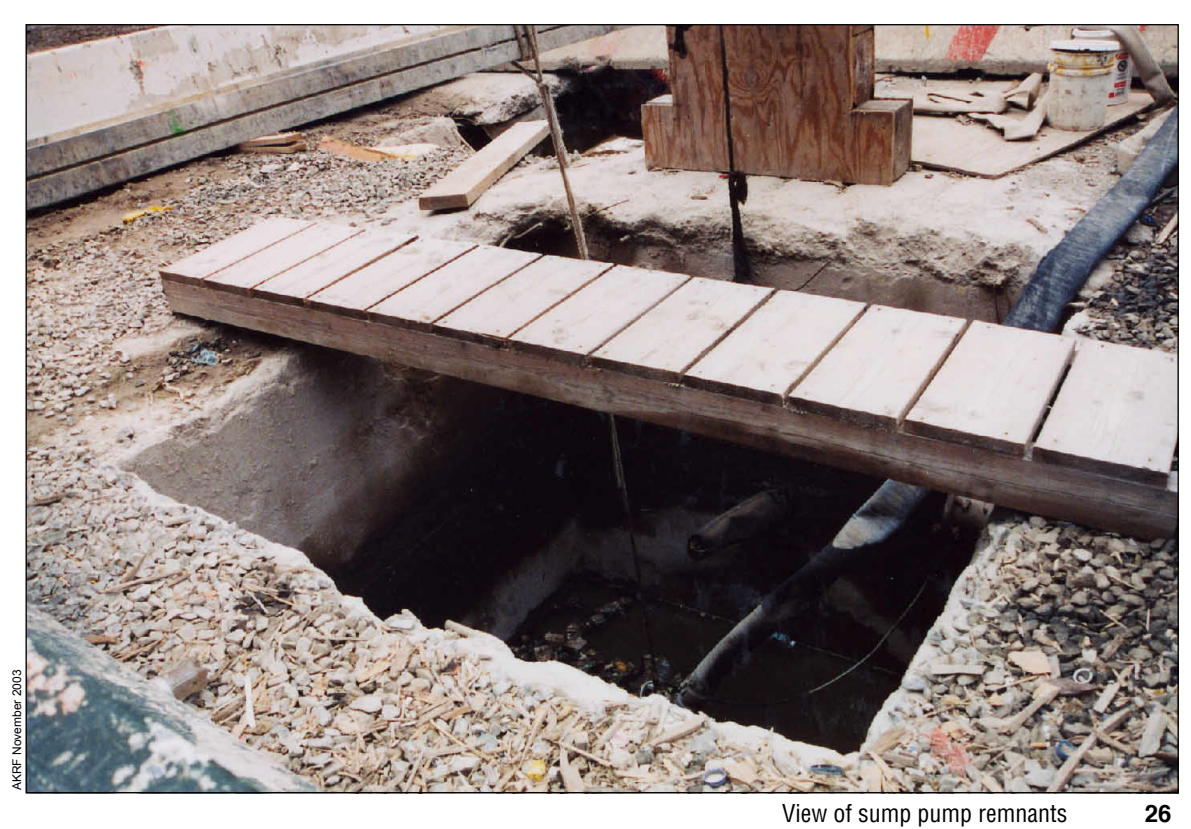
View of sump pump remnants