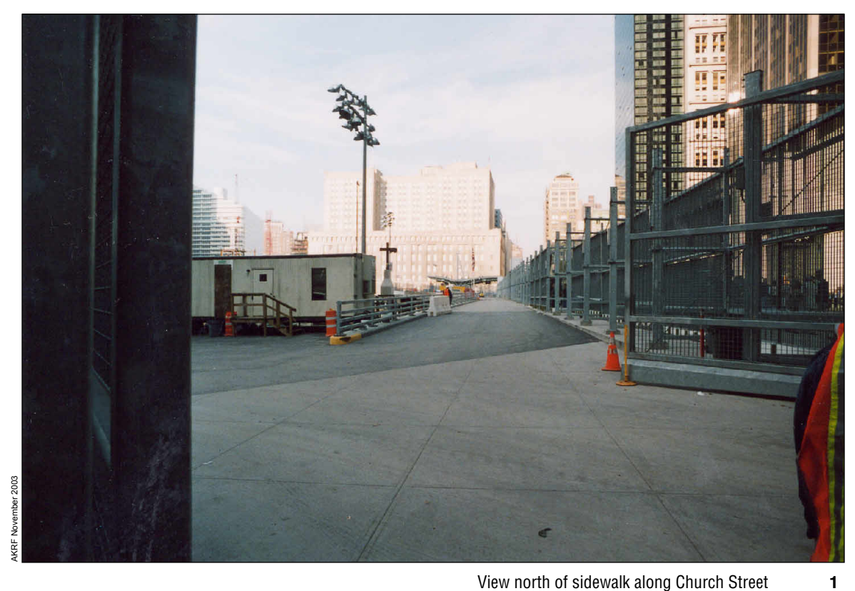
View north of sidewalk along Church Street