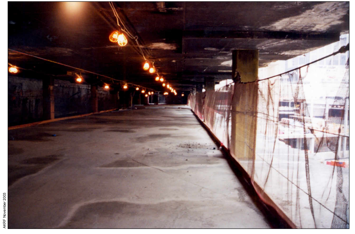
View of 6 WTC remnants, showing former area of below-grade parking 15