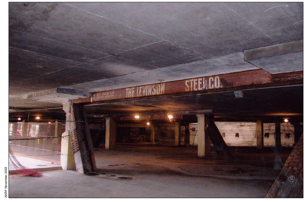
View of 6 WTC remnants, showing former area of below-grade parking 17