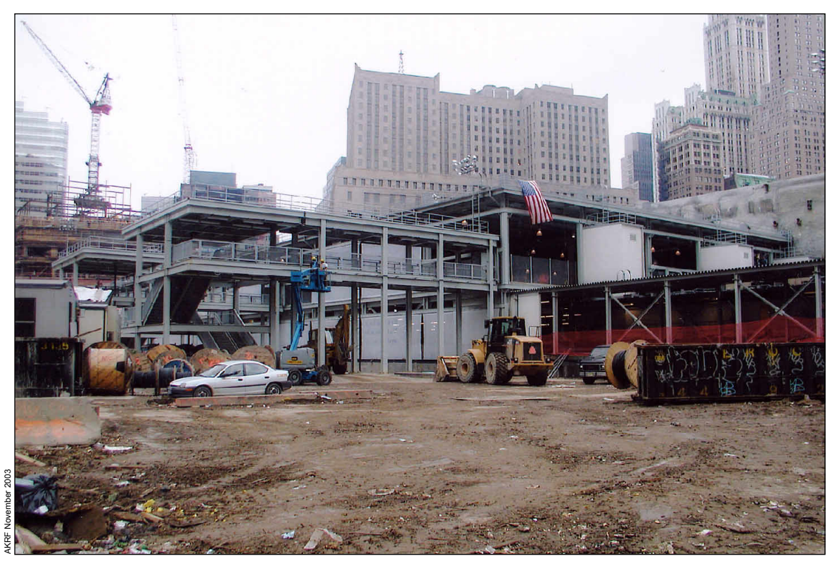
View northeast of temporary WTC PATH station 12