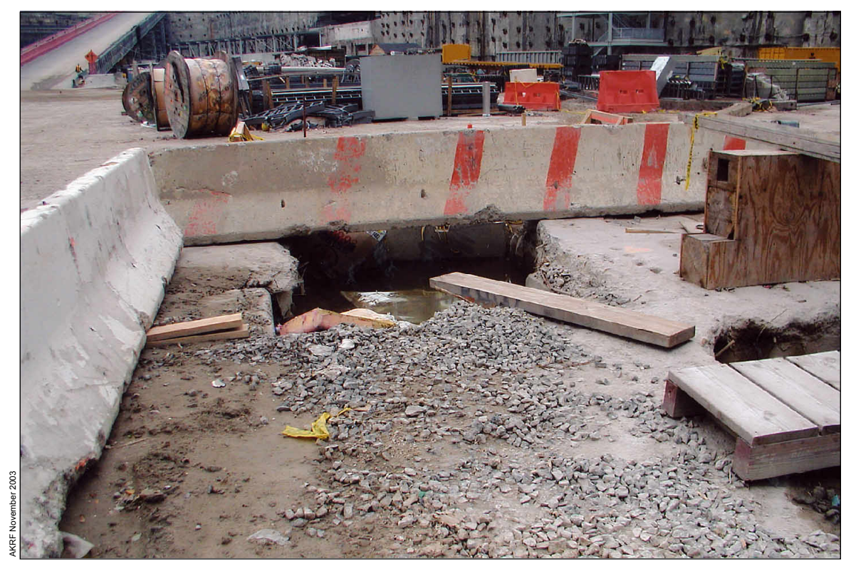
View southwest of sump pump remnants 25