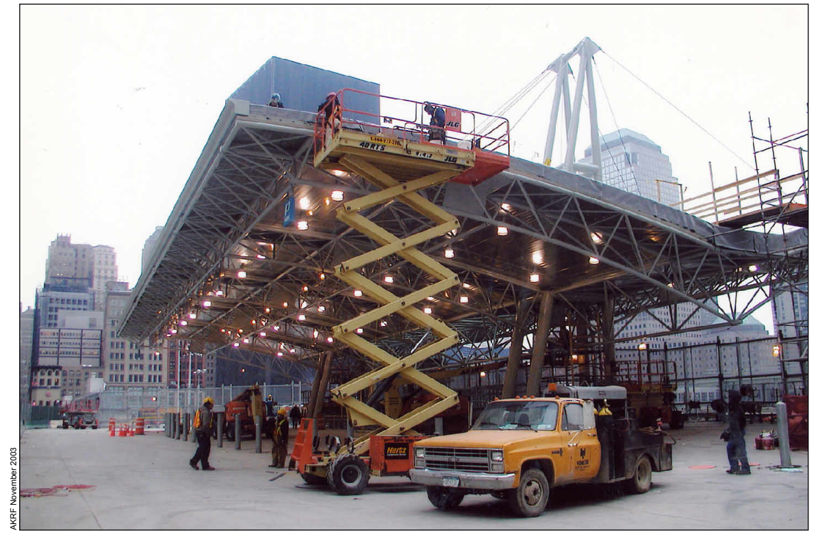
View southwest of temporary WTC PATH station 27