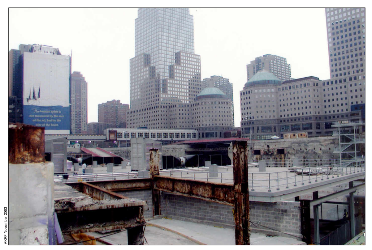
View southwest across WTC site 13