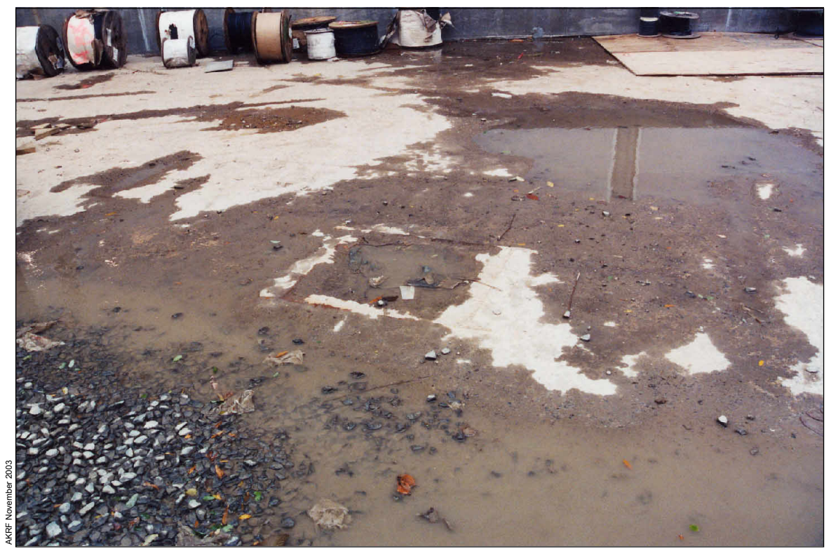
View of box-beam column base (North Tower) 23