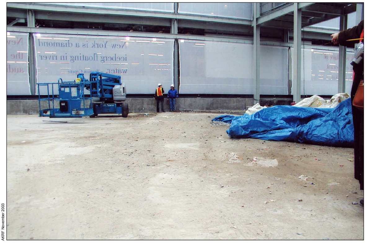
View southeast of box-beam column bases (North Tower) 19