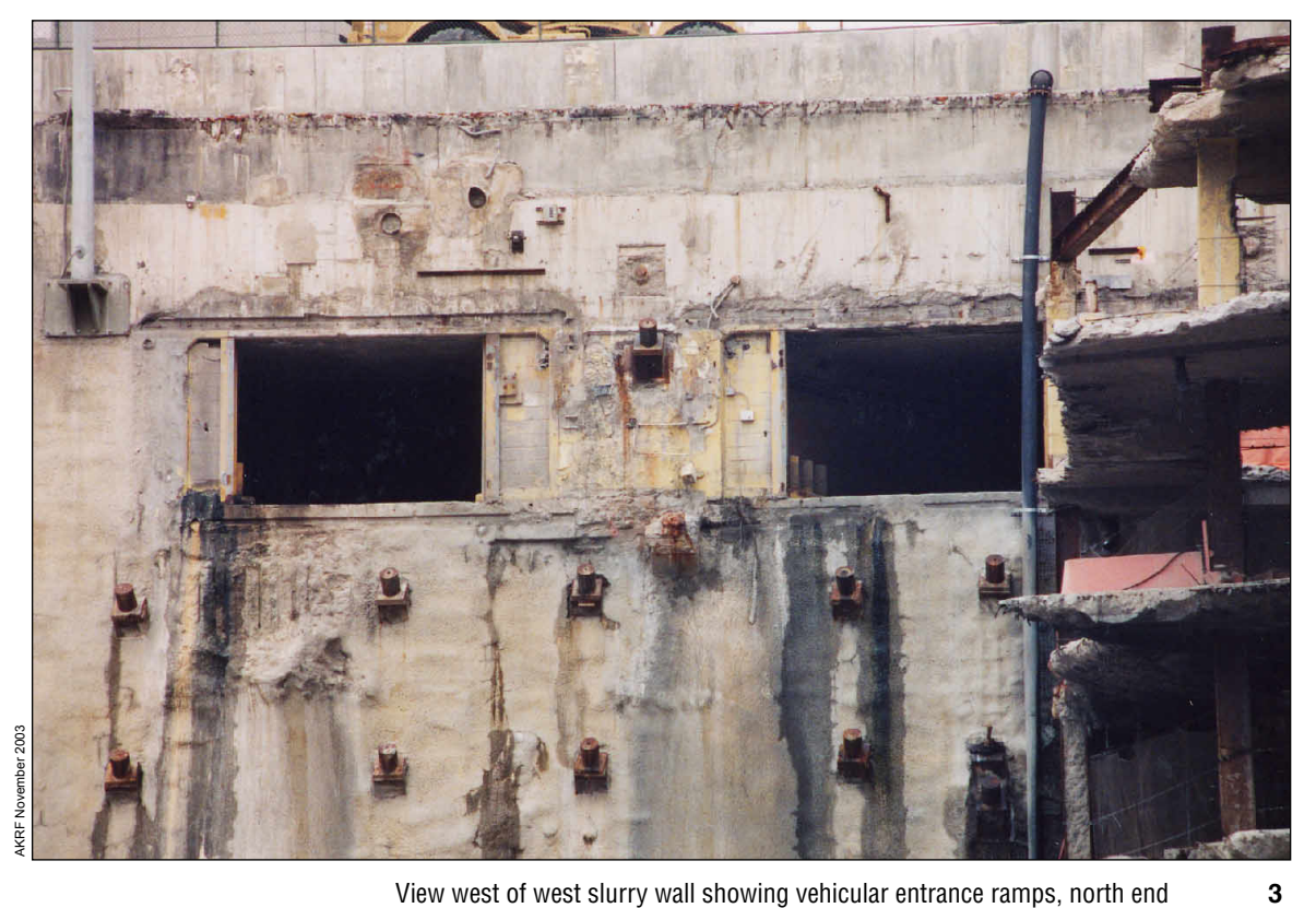
View west of west slurry wall showing vehicular entrance ramps, north end