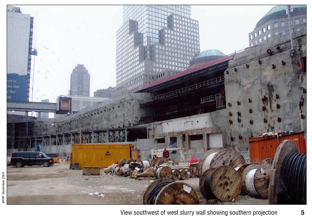
View southwest of west slurry wall showing southern projection