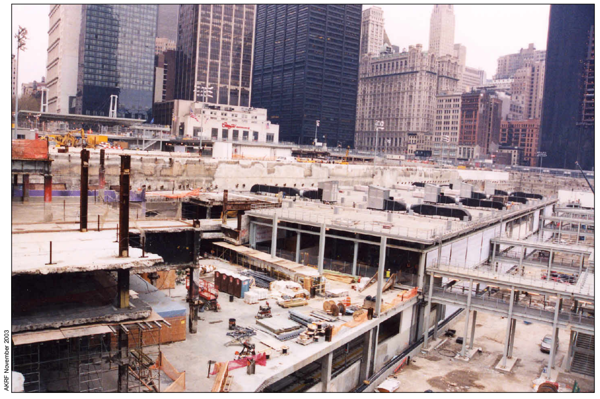
View southeast of temporary WTC PATH Station 11