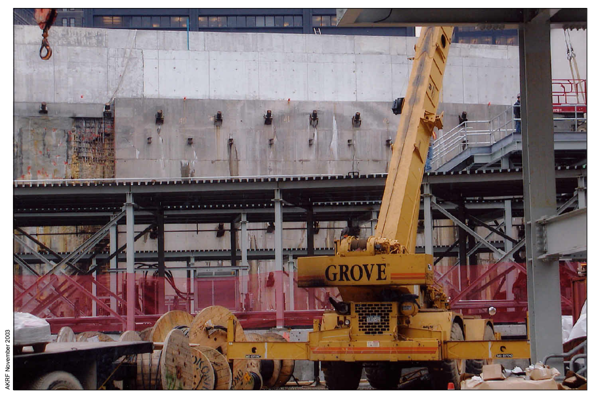
View southeast of east slurry wall 9