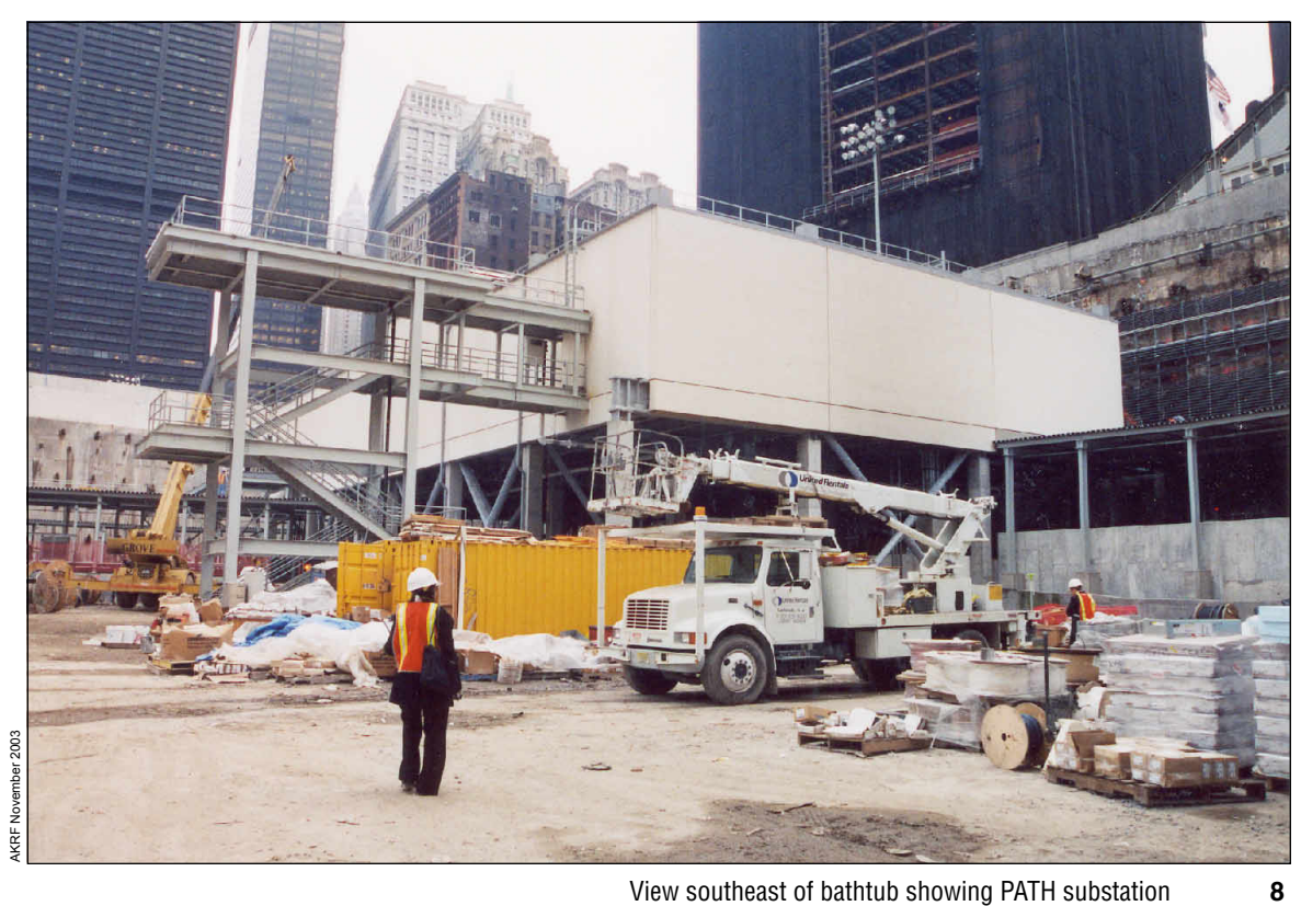
View southeast of bathtub showing PATH substation