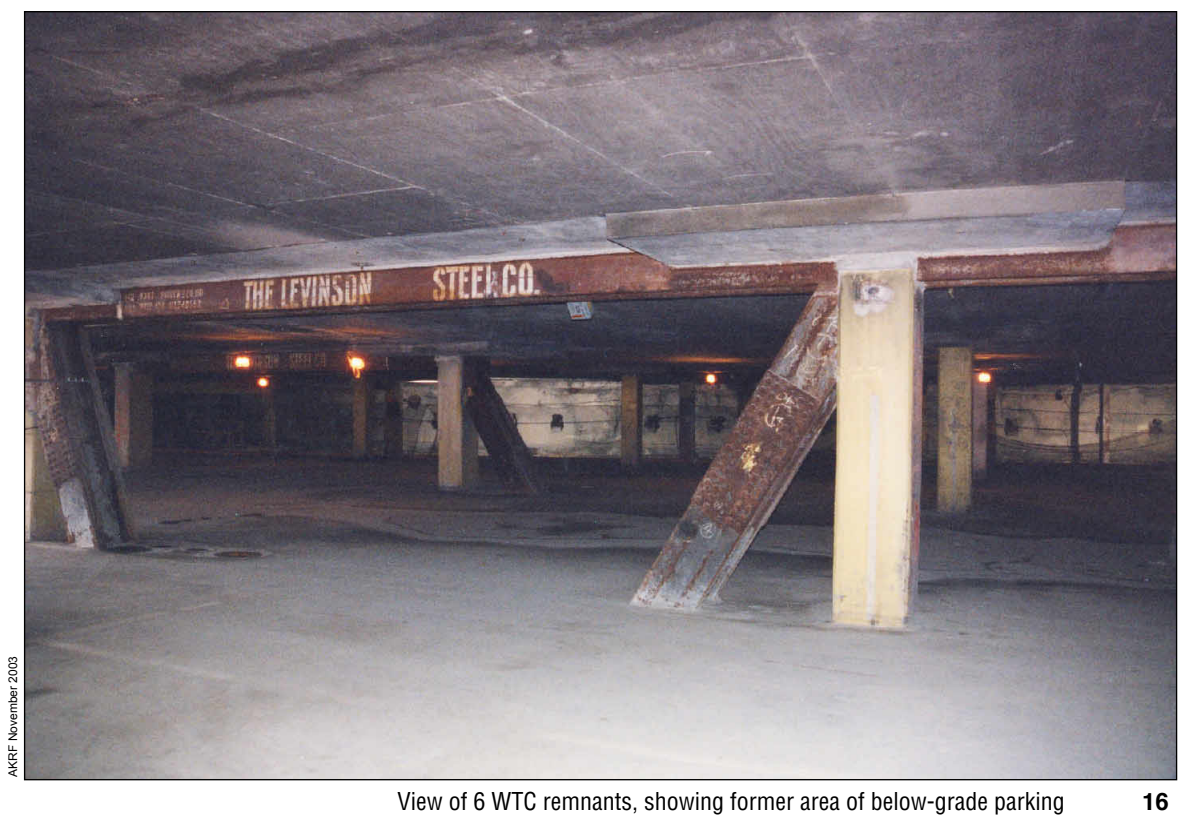
View of 6 WTC remnants, showing former area of below-grade parking