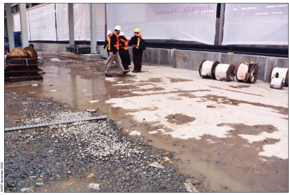
View northeast of box-beam column base (North Tower) 24