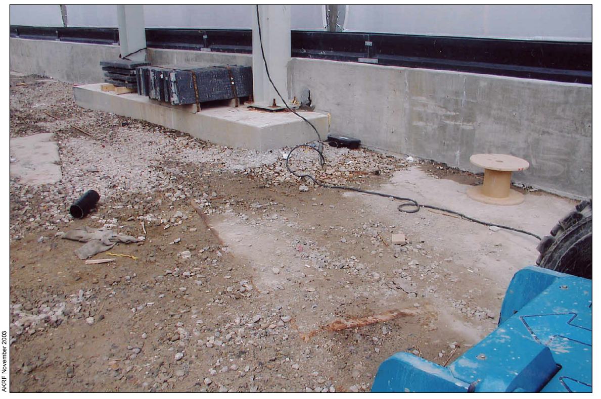
View northeast of box-beam column base (North Tower) 21